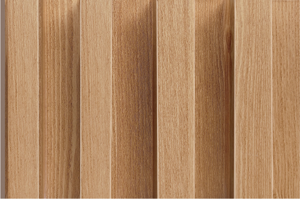
4 G - 900 - Pine