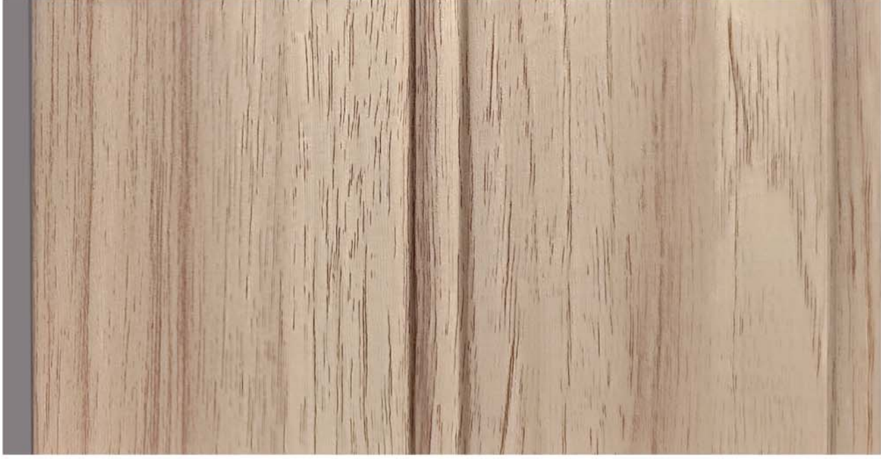
2 G - 900 - Light Walnut