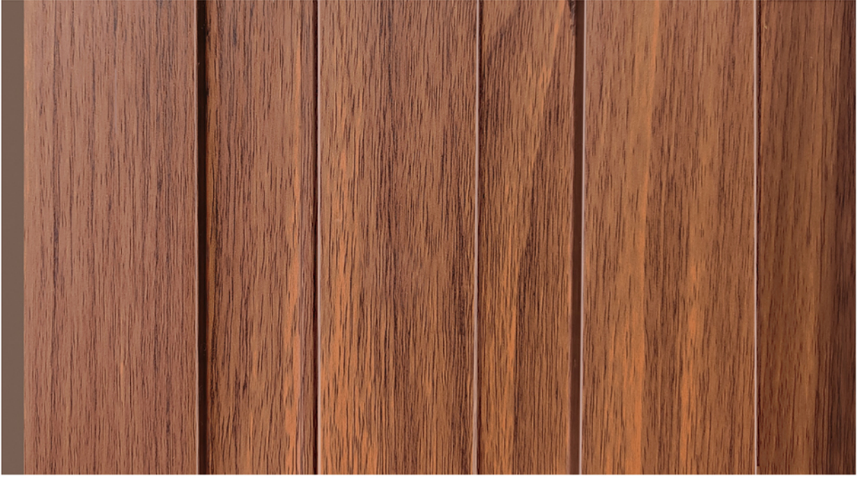
3G - 450 - Rosewood