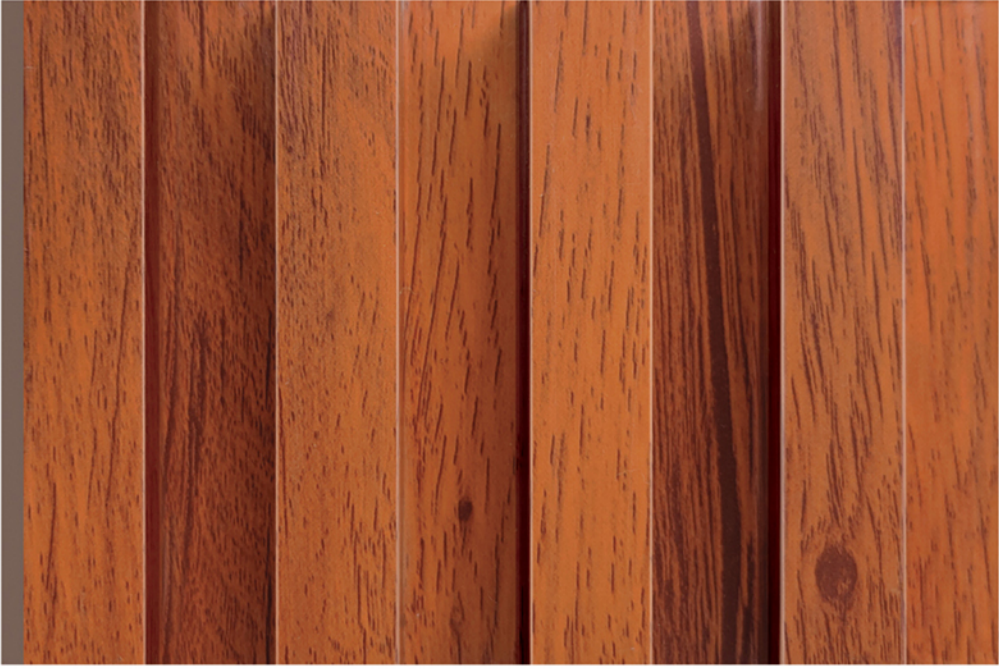
4 G - 720 Australia Oak