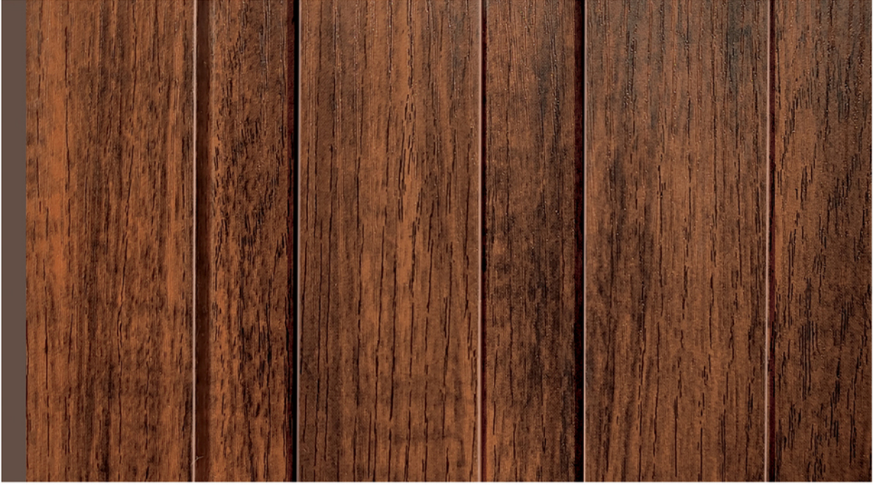
3G - 360 - Nanmu