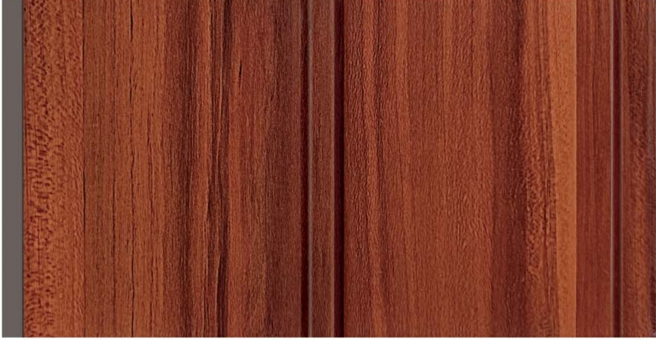
2 G - 720 - Sandal Wood