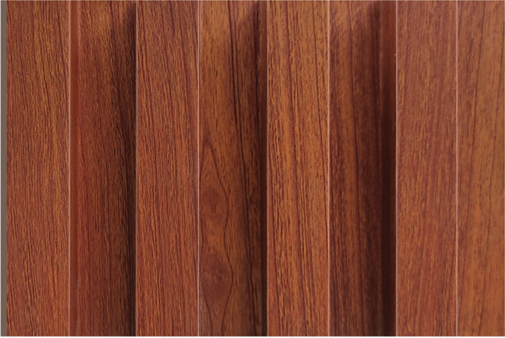
4 G - 450 - Brown Sandal wood