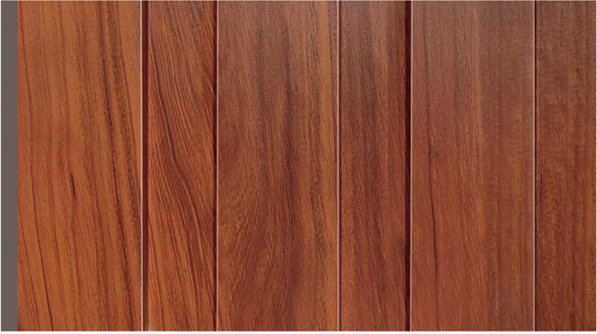
3G - 720 - Sandal Wood